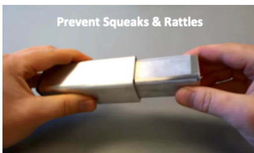
Prevent Squeaks & Rattles