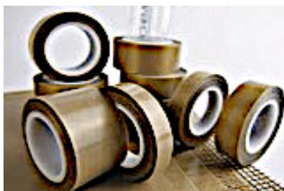
PTFE Coated Fabric Tape – Self-Wound