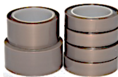
PTFE High Modulus Film Tape – Self-Wound