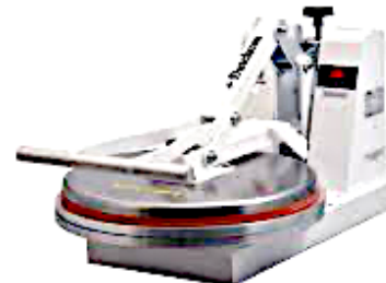
Pizza & Tortilla Presses