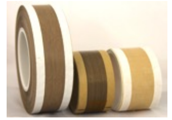
PTFE Coated Zone Tape