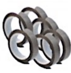
PTFE High Modulus Tape