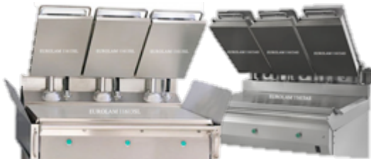
Clam Shell (EUROLAM™ is 2X More Durable)