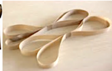
PTFE Coated Fiberglass Band