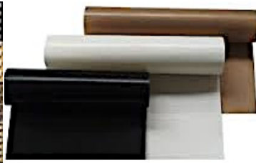
PTFE Coated Fabric