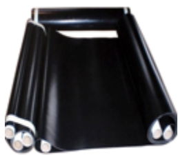
Textile Fusing Belt