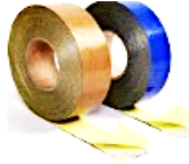
PTFE Coated Metal Detectable Tape