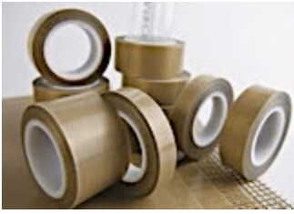
PTFE Coated Glass Tape