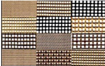
PTFE Coated Open Mesh Fabric