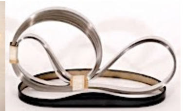
PTFE Coated & Uncoated Steel Band