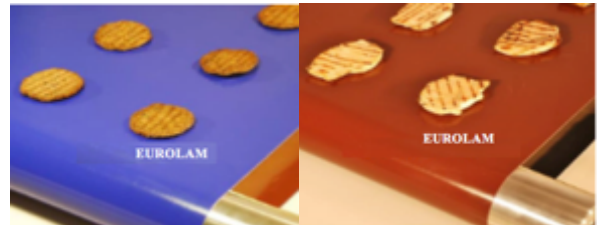
EUROLAM™ Food Processing Belts are 2X More Durable)